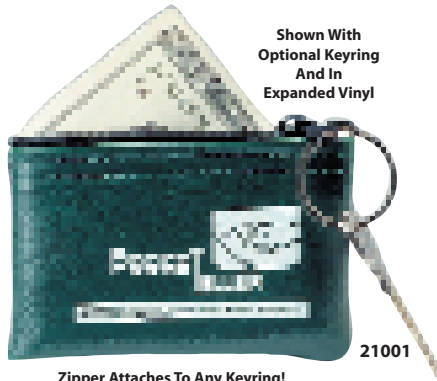
4-1/2" x 2-1/2" Pocket Holder

Shown With Optional Keyring And In Expanded Vinyl