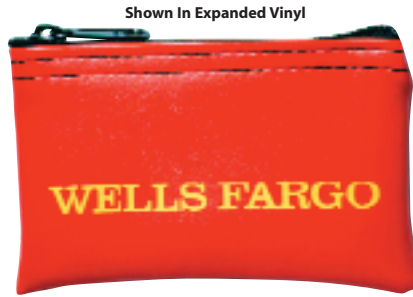
5" x 3" Mini Wallet Bag

Zipper Attaches To Any Keyring! Keyring does not ship attached. Keyring not included. For keyring add $ 0.15 (g) each.